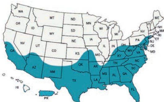
Distribution of Aedes aegypti