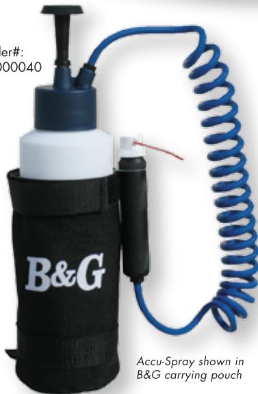
Accu-Spray shown in B&G carrying pouch