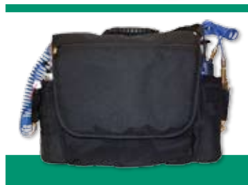
Now use the AccuSpray Professional with the new IPM Case. See page 12 for more info.