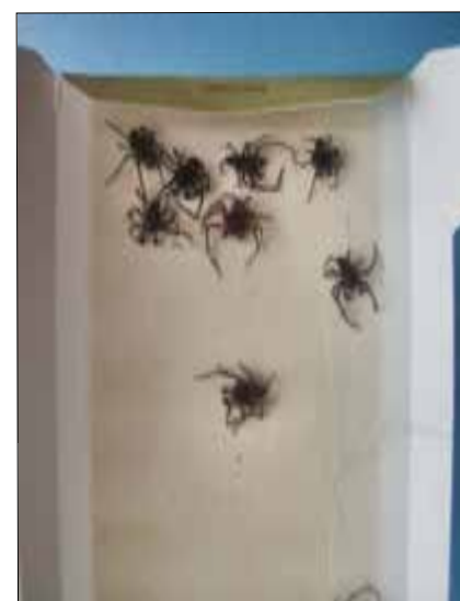
Sticky traps are effective when placed along an edge