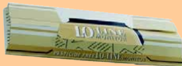
Lo-Line Insect Trap available in RTU and with original food attractant tablet

And that reassures your customer that they made the right decision to have your valuable company's service as a part of their household budget.