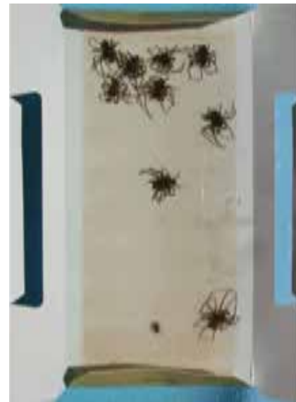
The position of the spiders on the glue clearly indicates that they moved up the ramp and then fell over the edge

Insects and spiders typically move along edges—ants will follow along the edge of a window to enter, cockroaches follow along the edge of a baseboard—and sticky traps are effective when placed along an edge. In this case, the Lo-Line was placed where it intercepted spiders scurrying along the baseboard under a bed. These are all male spiders...maybe the females will show up later.