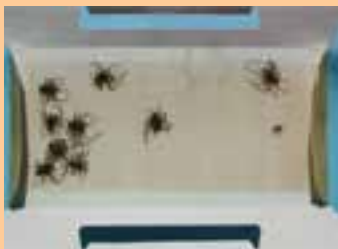
A few of these under your customer's bed gets their attention

And while we're discussing sticky traps, give some thought to the Lo-Line Insect Trap. The Lo-Line gives you a unique trapping device that integrates a number of different concepts giving you an edge over pests. One innovation is the 4 sided ramp design. Each ramp has a 30° angle which was determined by University of Wales to be optimal for trapping pests. Another innovation is the attractant built in to the trap. It is superior for catching cockroaches and now appears to be highly effective for bed bug monitoring according to Bed Bug Central .