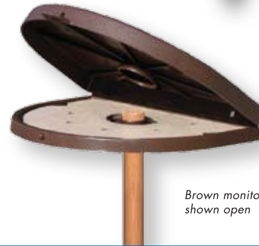
Brown monitor shown open

* Pallet quantity ** 1/2 Pallet quantity